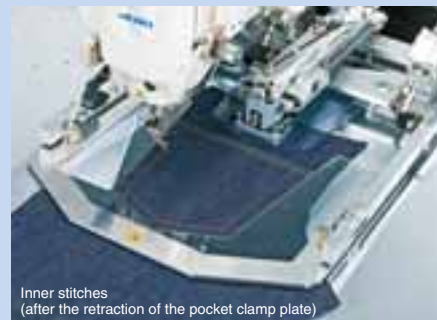
Inner stitches (after the retraction of the pocket clamp plate)