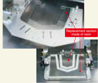
Pocket presser plate