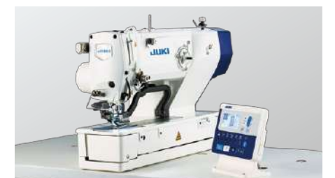
LBH-1790S: Buttonholing Machine

VIET LE CO., LTD. Sewing & Textile machines and Parts