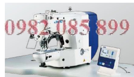
LK-1900S: Bartacking Machine