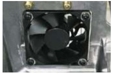
Cooling fan kit