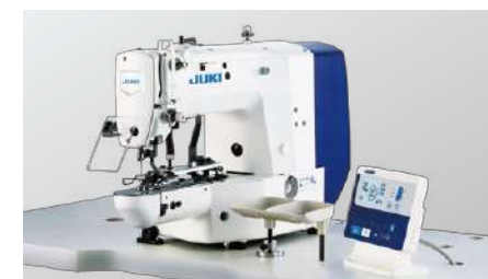
LK-1903S: Button Sewing Machine