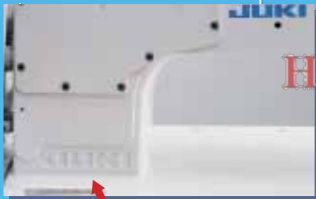
Embossed JUKI mark