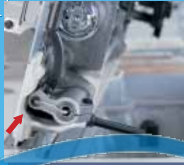
Feed eccentric pin

In addition, the machine is provided with a mounting seat for attachment to improve workability while replacing the attachment and increasing the durability of the machine bed surface.