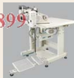
Table stand for the MS-3580 (without casters)

★ This table stand is specifically designed for the SC-510. The M-51 motor should be used.